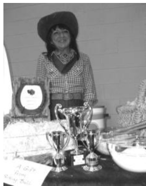
Prize winning chili!

There will be a suggested $50 entrance fee for groups and a suggested $25 entrance fee for individuals. Please contact Penny Goldberg for more information and to sign up for the competition ( penny@holycopostle.net ). In